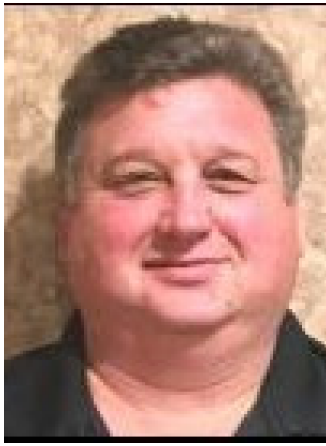
Jimmy Thomson Building