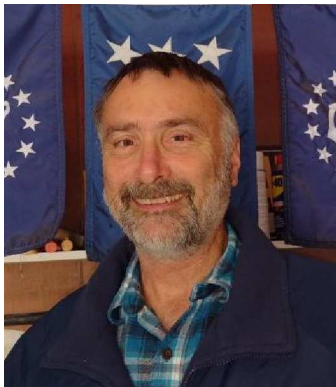
Gary Kuschel House

Darn project is wrapping up do to weather conditions.