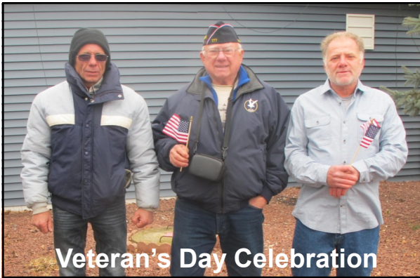
Veteran's Day Celebration