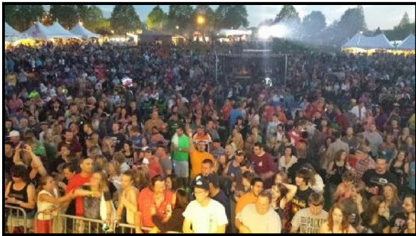
De Pere Fest 2014