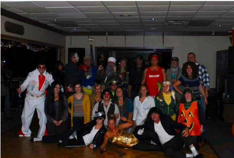
Thank you to those who stepped up for the Halloween party... Looking toward 2014. " live from the yacht club, it's Saturday night"

Looking toward to a jam-packed year of fun and camaraderie with all of you. Thank you in advance for all your help!