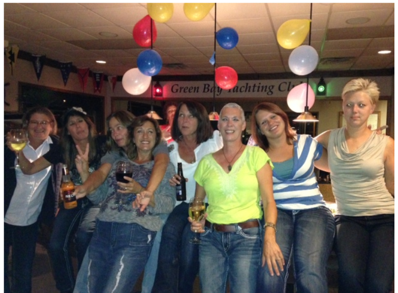
Autumn Fest 2013 had great turnout