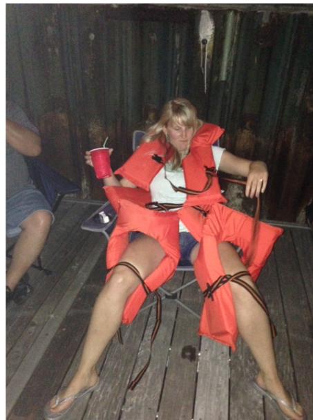
Safety First when on the Water and the Dock!