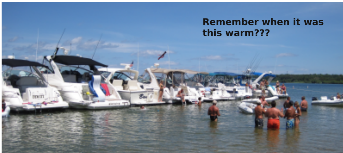
Remember when it was this warm???