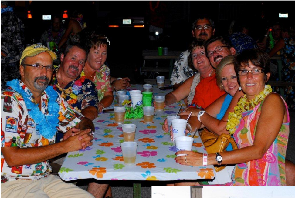
Everyone had a great time at the GBYC Luau!